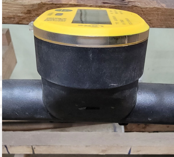
Figure 2: Side View