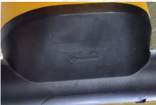
Figure 3: Flow Direction Arrow