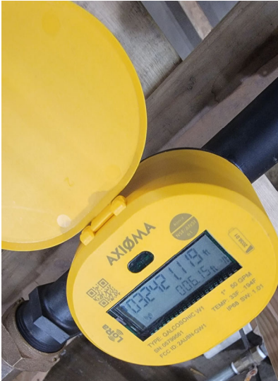
Figure 1: Register Face