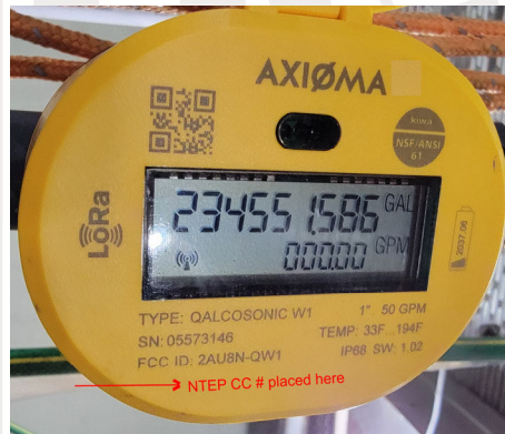
Figure 4: NTEP Stamp Placement